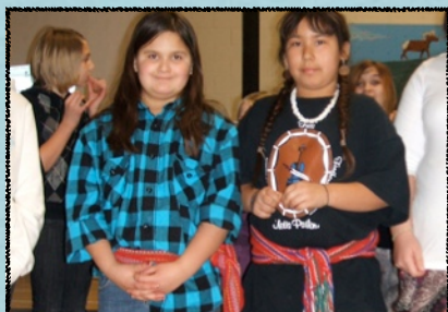
LOUIS RIEL DAY Once again this year, staff and students celebrated Louis Riel Day with a day full of entertainment, activities and food, dedicated to Manitoba's past, and especially it's Metis roots.