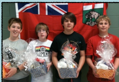
MANITOBA DAY Several students took home prizes in a Heritage Fair sponsored by the New Iceland Heritage Museum in Gimli to mark Manitoba Day.