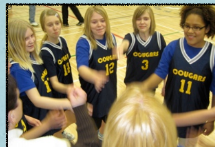
From the Athletics Department Once again DGJMS dominated divisional middle years athletics, winning in many competitions, including the marquee events of Basketball, Volleyball and Track & Field.